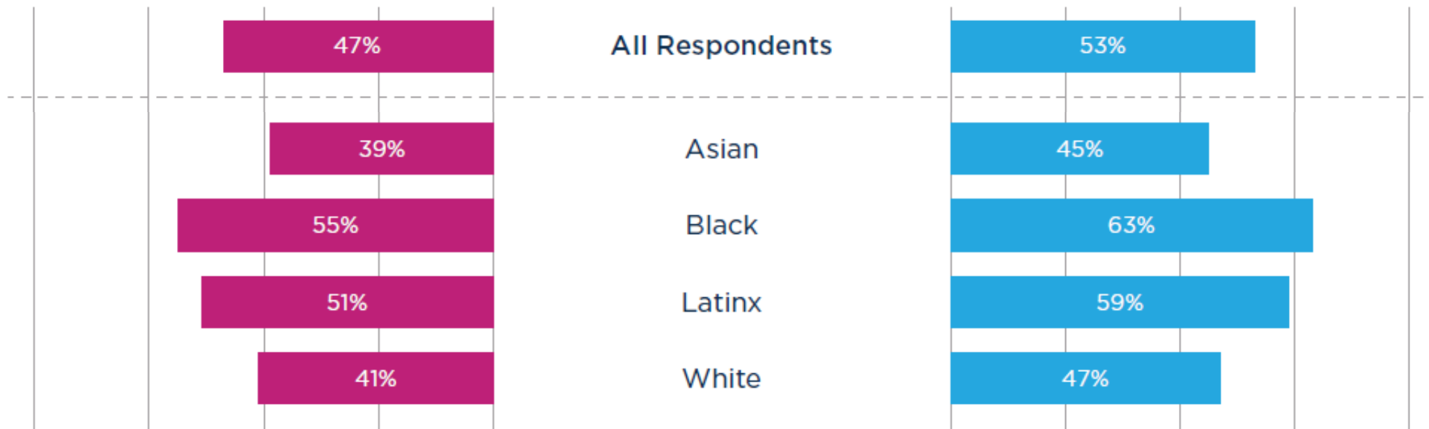
Increased weekly food expenses