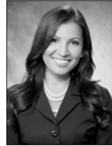
by Lizette Navarette Legislative Advocate

In other changes ahead for colleges, the 2014-15 higher education trailer bill language outlined a prescriptive new growth allocation mechanism for the 2015-16 fiscal year, mandating how the formula should be developed and implemented. It requires that the formula “support the primary mission of the colleges and be based on each community’s need for access determined by local demographics.” While the Legislature intended to fashion a formula similar to the K-12 Local Control Funding Formula (LCFF) to provide additional funding for disadvantaged students, there are major differences which mitigate against using a similar allocation formula for community colleges. They include: 1) community colleges, unlike K-12 schools, do not have mandatory enrollment so there is no assurance that needy individuals within their boundaries will choose to attend their local college; and 2) community colleges have free flow which leads many colleges to serve populations whose demography differs dramatically from residents within the district’s boundaries. The issue will continue to be an important focus for the League.