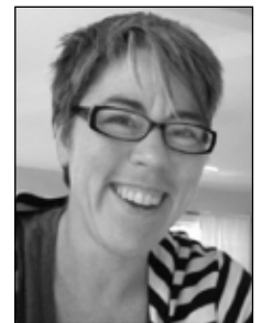
by Katie Hern, Ed.D.

W ith the publication of California’s Student Success Scorecards, community colleges are facing greater pressure than ever to increase student completion. In particular the scorecards spotlight the need to improve outcomes for students classified as “unprepared” for college, those who are required to take remedial coursework in ESL, English, and math. The most recent statewide scorecard shows that just 41% of these students went onto complete a degree, certificate, or transfer-related outcome within six years, compared to 70% of students classified as “college ready.”